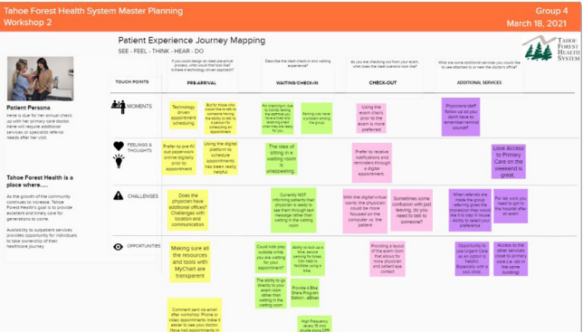
Screen shot from Community Workshop #2 - Discussion and activity mapping the ideal patient experience