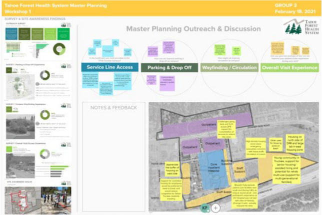
Screen shot from Community Workshop #1 - Discussion of key survey findings

After receiving input from the site awareness walks, a progression of three online community workshops offered a platform to further understand needs and influences on the campus. Each workshop started with a brief presentation by TFHS leadership sharing concepts, history, purpose, and long-term planning strategies. Each participant then was able to contribute to a brainstorming session regarding the patient experience and onsite needs that will help inform the TFHS Master Plan.