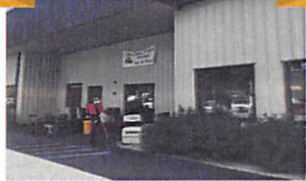
Tahoe Forest Hospice Gift & Thrift