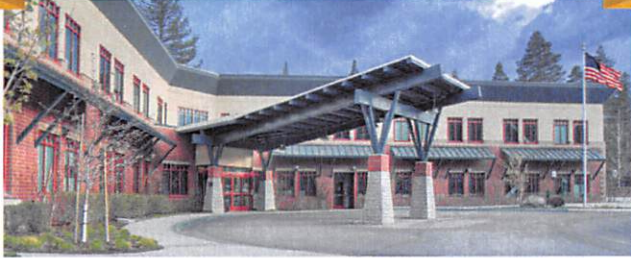
Tahoe Forest Hospital