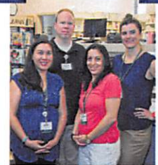
Tahoe Forest Pharmacy