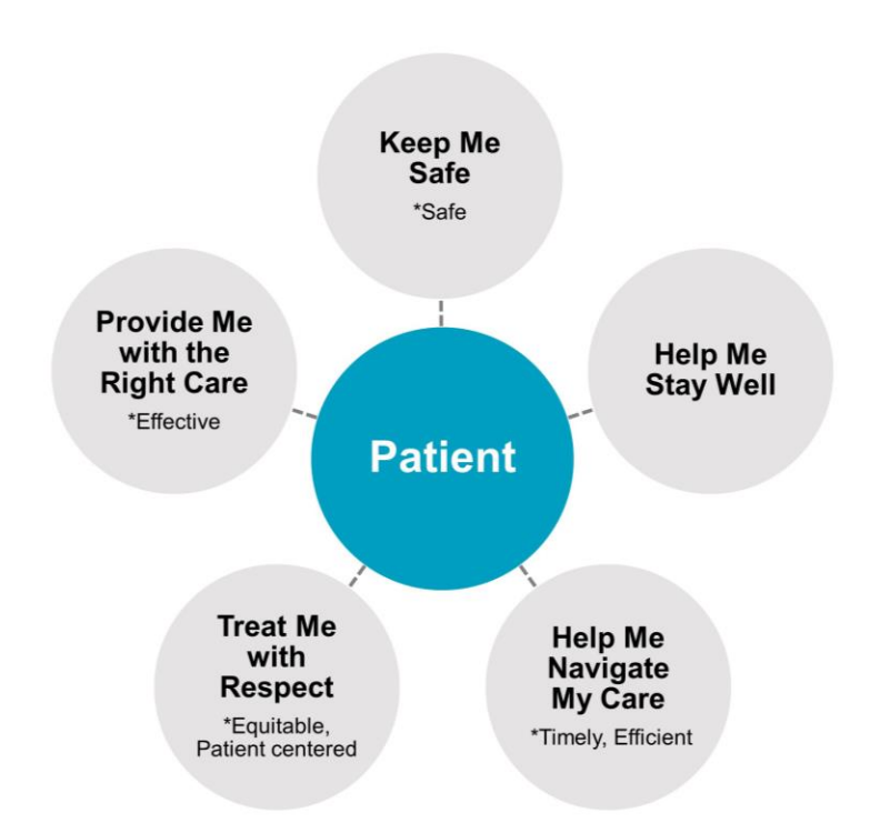
Figure 3. Core Components of Quality from the Patient's Perspective

This reframed model also bundles some elements of STEEEP together in a way that represents the patient journey and avoids some of the health care terminology that can be off-putting to trustees. For example, the STEEEP dimensions of timely and efficient care are combined into "Help Me Navigate My Care." The STEEEP dimensions of equitable and patient-centered care are aggregated into "Treat Me with Respect." Figure 3 presents a visual representation of the core components of quality from the patient's perspective, with the patient at the center of the delivery system.