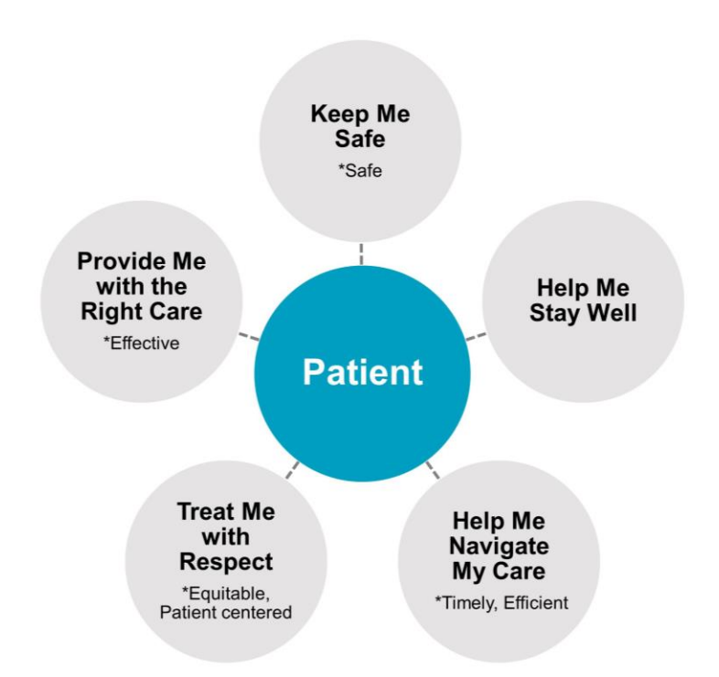
Figure 3. Core Components of Quality from the Patient's Perspective

This reframed model also bundles some elements of STEEEP together in a way that represents the patient journey and avoids some of the health care terminology that can be off-putting to trustees. For example, the STEEEP dimensions of timely and efficient care are combined into "Help Me Navigate My Care." The STEEEP dimensions of equitable and patient-centered care are aggregated into "Treat Me with Respect." Figure 3 presents a visual representation of the core components of quality from the patient's perspective, with the patient at the center of the delivery system.