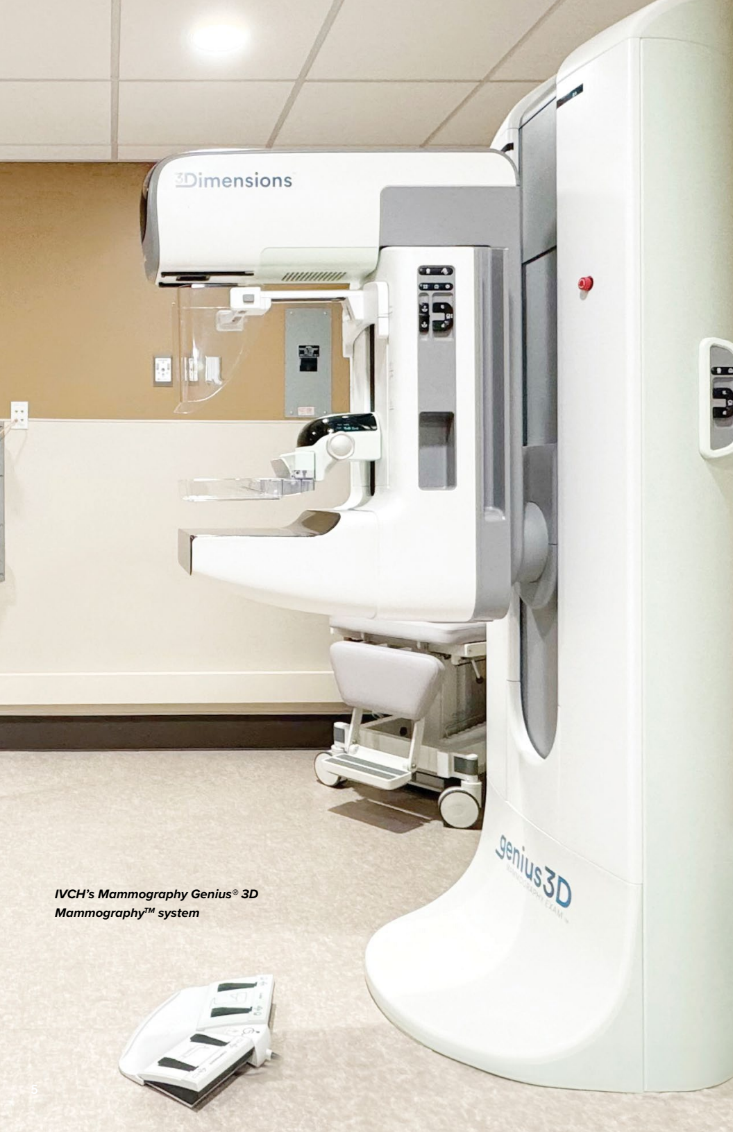
IVCH's Mammography Genius® 3D Mammography™ system