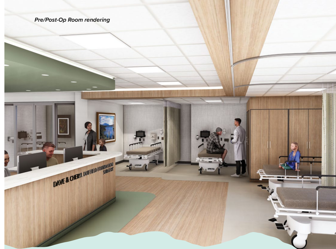
Pre/Post-Op Room rendering

Grant funding is made possible by the generosity of the Dave & Cheryl Duffield Foundation*, a private charitable foundation based in Incline Village, Nevada.