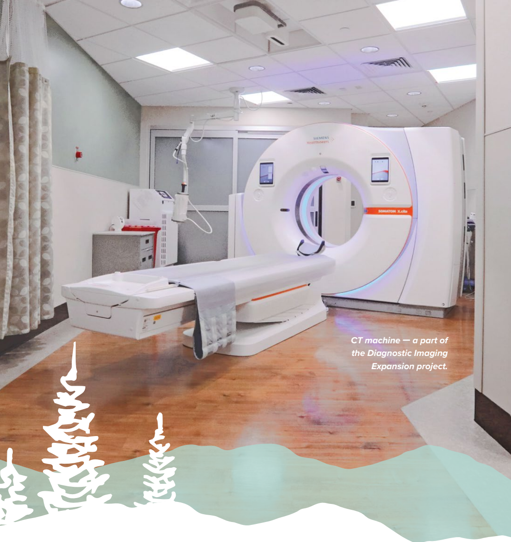
CT machine — a part of the Diagnostic Imaging Expansion project.